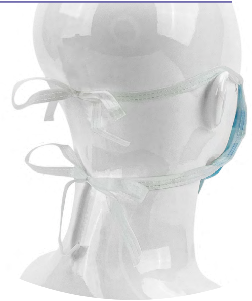
tied horizontally behind head