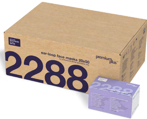
2288 20 boxes per carton