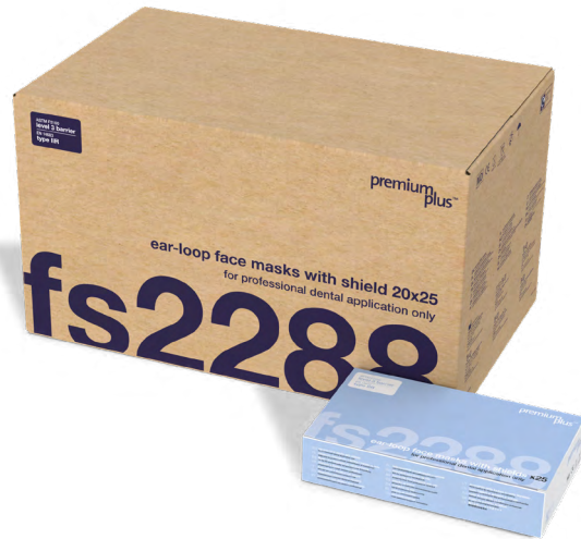
FS2288 20 boxes per carton