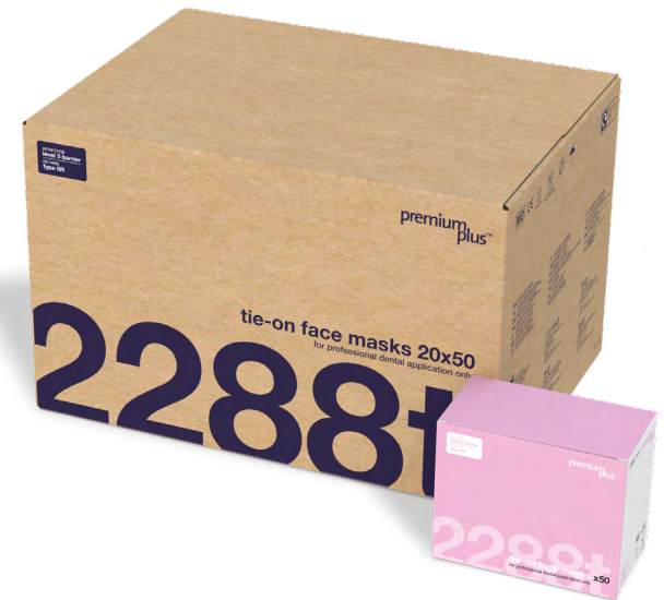
2288T 20 boxes per carton